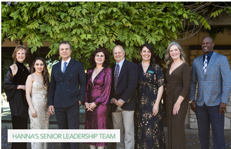
HANNA'S SENIOR LEADERSHIP TEAM